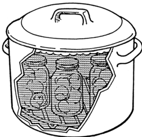
Water Bath Canner

Jar lids need to be prepared as instructed by the manufacturer ahead of filling time. Read the manufacturer's instructions on preparing and attaching lids. Instructions will not be the same for all lid types. With two-piece metal canning lids, the flat lid should be used only once for sealing new products, but the ring bands can be reused as long as they are in good condition. Ring bands should be free of rust and not bent out of shape. Flat lids should be free of dents, scratches and gaps or flaws in the sealing compound. Do not reuse lids from commercially canned foods for home canning.